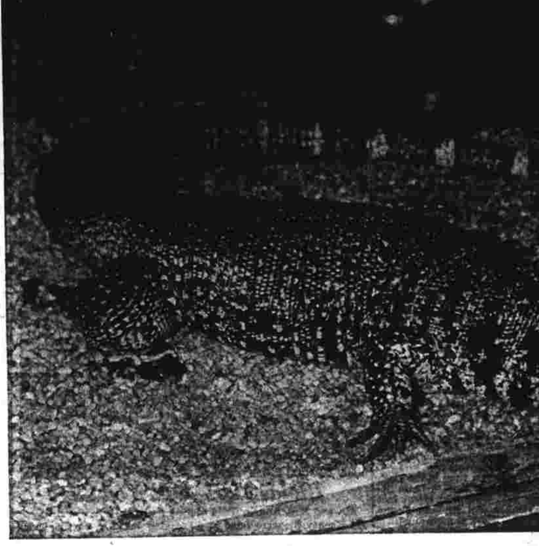
SOUTH AMERICAN TEGU: Live, At Lutz Museum